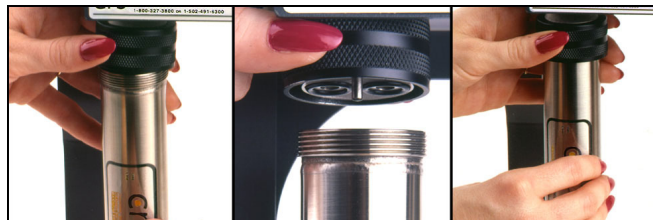
Figure 1. Replacing a cartridge. Loosen the ring nut, then remove the depleted cartridge. To re-install cartridge, locate the alignment pin and hole; place cartridge on the pin. Be careful not to scratch the cartridge top. Tighten the ring nut, hand-tight only.