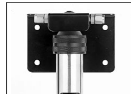
Standard Wall Mount Bracket

To mount on wall: The All-In-One or Single Cartridge System comes pre-assembled on a wall mount bracket. Position the purifier against the wall or vertical mounting surface and mark the locations of the four bracket holes. Wear eye protection while drilling. Drill 6.3mm (1/4") diameter holes to a depth of 3 cm (1 1/4") at the four positions and insert the four plastic anchors supplied. Mount the purifier to the wall with the four slotted-head screws provided.