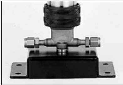
Figure 1. Bench Mounting the Purifier Two metal spacers position the manifold head above the bench-mount bracket.

To mount on bench: Remove the manifold head from the wall-mount bracket by unscrewing the two allen-head screws. See Figure 1. Attach the manifold head to the bench-mount bracket as follows: Thread the two allen-head screws from underneath the bench mount bracket, through the metal spacers (see photo) and into the manifold head. The spacers will create enough clearance to fit wrenches onto the fittings. Tighten screws. For temporary placement on a bench, attach felt pads to the bottom of the